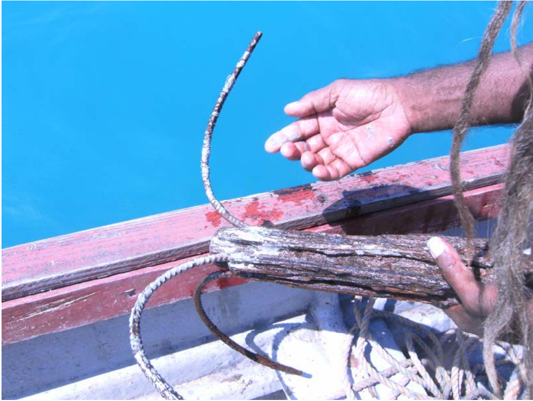
Plate3. Substrate test at ZK06. The substrate was confirmed to be white mud. (Photo by R. Carroll 2014/05/06).