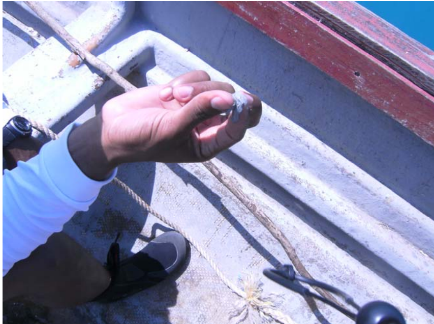
Plate6. Substrate test at ZK15 confirmed mud and sea fauna mixture. Visibility was poor in this area. (Photo by R. Carroll 2014/05/06)