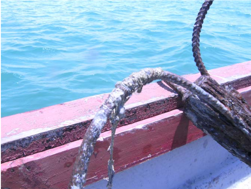
Plate5. Substrate test at ZK12 confirmed mud and sea fauna mixture. Visibility was poor in this area.