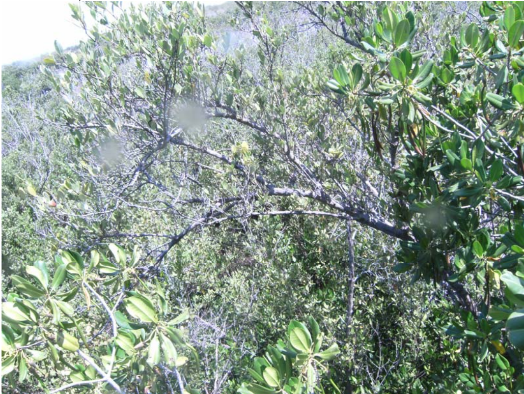
Plate4. Aerial view of the area around ZK09 ((Photo by R, Carroll 2014/05/06)